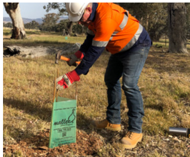
Goldwind staff undertaking supplementary planting.