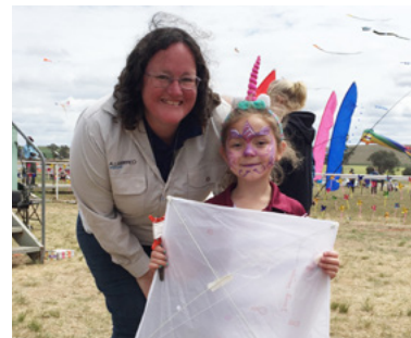
Coppabella Wind Farm's sponsorship of the Harden Kite Festival.