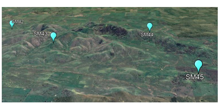
Coppabella Autumn Bat Recorders