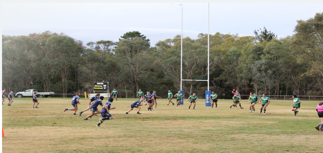
Binalong Brahmans Game

CWF is looking forward to seeing the Binalong Brahmans compete this year.