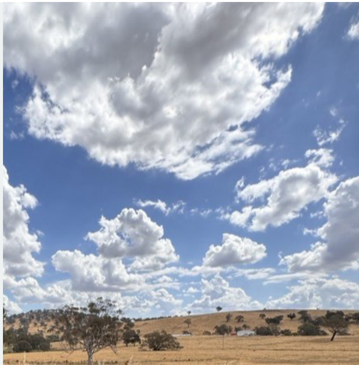
The Coppabella Hills

The Coppabella Wind Farm (CWF) is heading towards construction, with early planning underway.